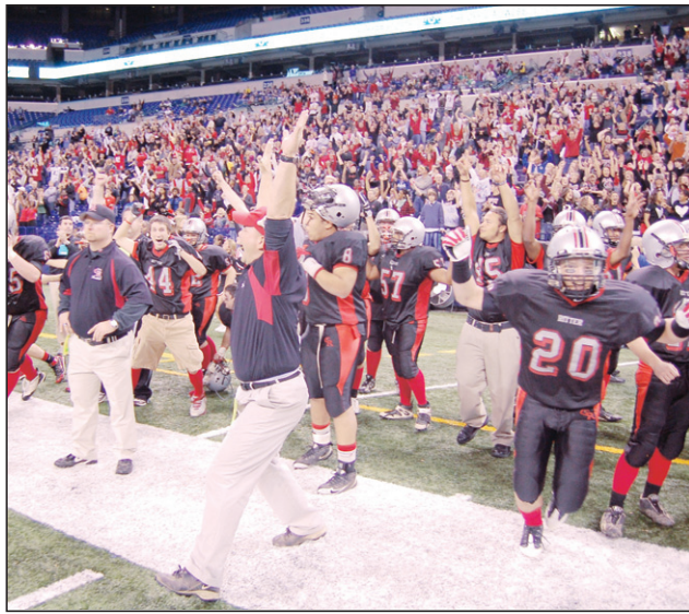
Cardinal Ritter's sideline and crowd explode with joy during the team's 34-27 win.