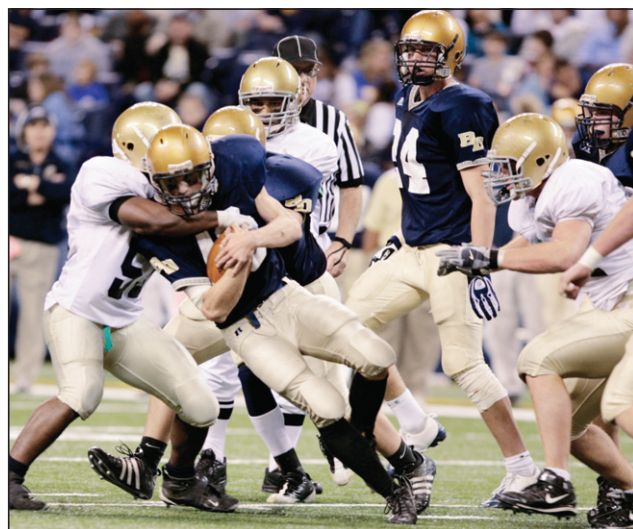
Cathedral's defense rose to the occasion during the team's 10-7 win.