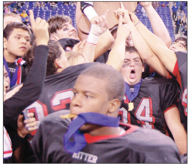
Nothing tastes better for Cardinal Ritter's players than finishing the season No. 1.