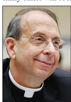
Archbishop William E. Lori

"As many people are being forced—and many others will soon be forced—to either