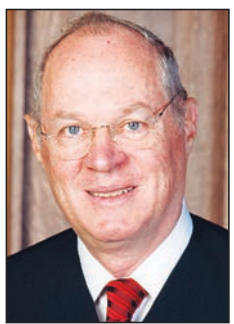
Justice Anthony Kennedy

In a 7-1 ruling written by Justice Anthony Kennedy, the court sent the case back to the 5th U.S. Circuit Court of Appeals to reconsider it under an exacting standard of strict scrutiny to two previous Supreme Court rulings dealing with the Equal Protection clause of the Constitution.