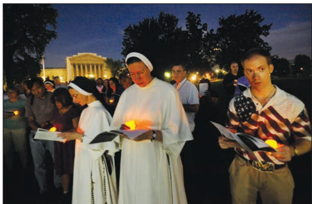
The U.S. Supreme Court is seen in the background as nuns and others pray during a candlelight vigil during the second annual Fortnight for Freedom observance outside the U.S. Capitol in Washington on June 22. The campaign, initiated by the U.S. bishops in 2012, calls for a two-week period of prayer, education and action on preserving religious freedom in the U.S. The observance ends on July 4, Independence Day.

“I think it’s important that we pray for our religious freedom,” she told Catholic News Service (CNS). “It’s important that we pray for our leaders that are in the Capitol and it’s important that we pray and show the world and the United States that we value our religious freedom.”