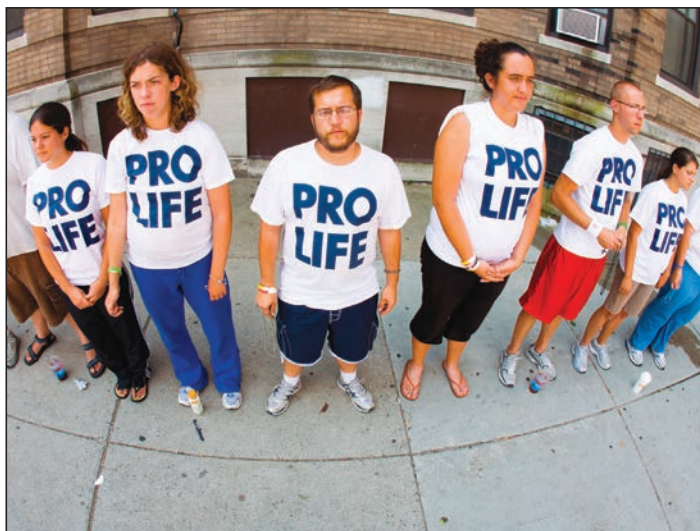
Pro-life activists from Crossroads USA pray across from a Planned Parenthood facility on Commonwealth Avenue in Boston in this July 2007 file photo. The U.S. Supreme Court on June 24 agreed to hear a case challenging a 2007 Massachusetts law barring protests in 35-foot “buffer zones” around abortion facility entrances, exits and driveways.