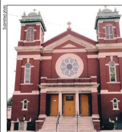
The former St. Francis de Sales Church in Indianapolis.

Students of the former St. Francis de Sales School in Indianapolis will hold their second all-school reunion at Our Lady of the Greenwood Church's parish life center, 399 S. Meridian St. in Greenwood, at noon on July 13.