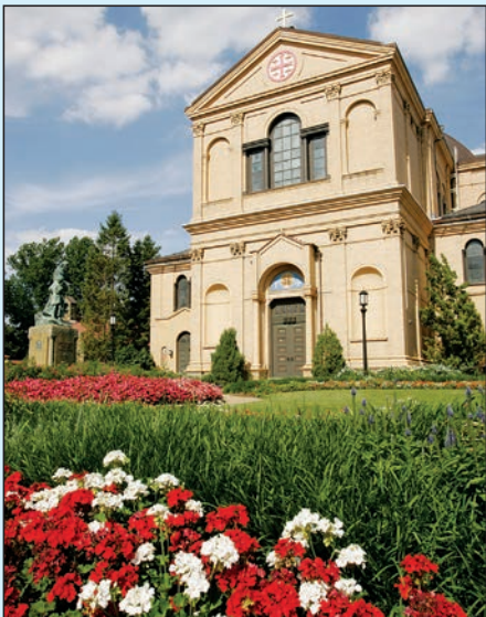
Flowers are seen in front of the Franciscan Monastery in Washington. Gardens at the monastery feature many plants mentioned in the Bible.

For many people, gardening is a spiritual exercise. For them, planting seeds and seedlings, tending and nurturing them, pruning and watering