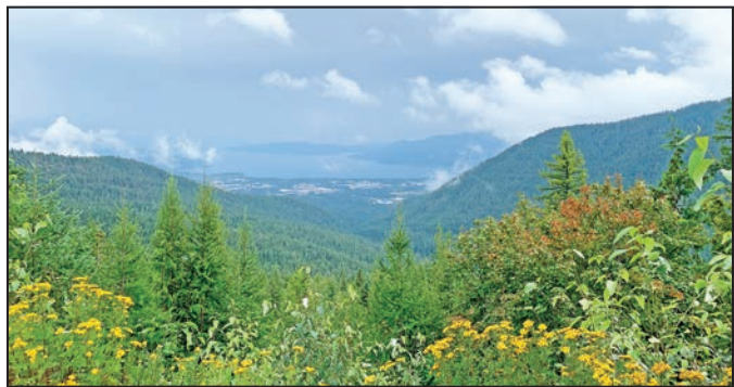
Lake Pend Oreille and Sandpoint, Idaho, are seen from Schweitzer Mountain Resort in this Aug. 11 photo. The ecumenical World Day of Prayer for the Care of Creation is celebrated on Sept. 1 by Ecumenical Patriarch Bartholomew of Constantinople and Pope Francis.