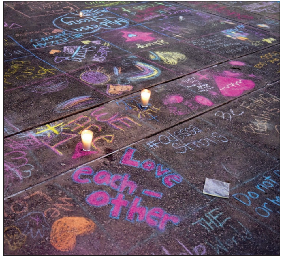
Messages written in sidewalk chalk are seen as people gather for a Sept. 1 vigil following an Aug. 31 mass shooting in Odessa and Midland, Texas.

“There are no easy answers as to how to end this epidemic of gun violence in our state and in our country. I ask the Lord to enlighten all of our hearts and minds, especially our government leaders,