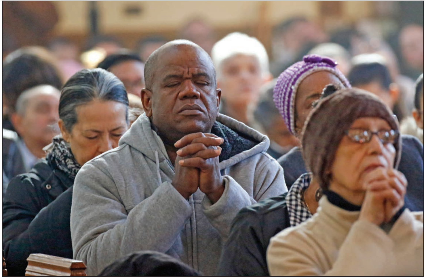
People pray during a Mass at St. John-Visitation Church in the Bronx, N.Y., on March 24.

—Keep prayer and the sacraments front and center. We grounded our days in prayer and the sacraments. Many thought